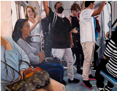
"Expo Line", Acrylic on canvas, 40" x 30"

"I, Voyeur" is based on a series of images that Entrop has captured while riding through public transportation in Los Angeles. As a commuter, she would spend two to three hours a day on the bus or train and even longer waiting for their arrival. As Entrop rode with the same people day after day, she observed those people going to the same places. She never spoke or engaged with them. Entrop explains, "All of us are on our own tracks, playing out individual narratives. I was drawn to certain people in this travel routine that seemed almost like characters in a play, always having some element that was interesting or different about them. I started taking their pictures, secretly capturing moments from their lives."