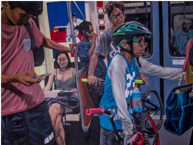
"Red Line", Acrylic on canvas, 40" x 30"